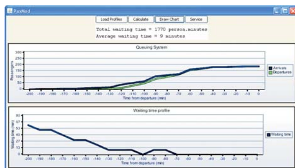
Fig 1 Evolution of passenger arrivals, departures and waiting times at the Check-in (screen shot from PaxMod).