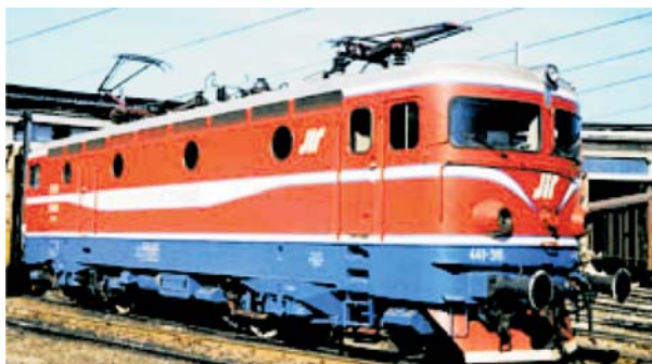
Fig. 1 The electric locomotive series 441

high unification of equipment on locomotives of series 441 and 461 and maintenance cost reduction. Total number of locomotive series 441 is 76 (441: 46, 444: 30) and of series 461 is 53.