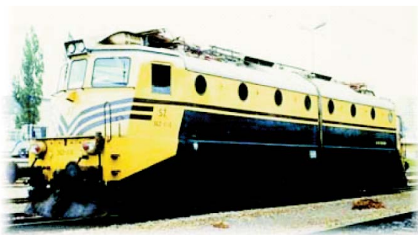
Fig. 5 The electric locomotive series 362