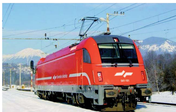
Fig. 7 The electric locomotive series 541