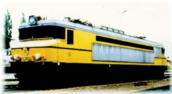
Fig. 6 The electric locomotive series 363