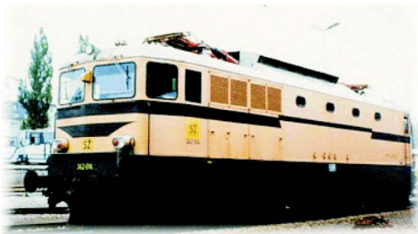
Fig. 4 The electric locomotive series 342

The fourth (four axles B'_0 B'_0 ) locomotive of the DC System 3 kV, series 342 was manufactured by Ansaldo Italy and has been operating in the region of Slovenian Railways since the year 1968 (Fig. 4). The next (six axles B'_0 B'_0 B'_0 ) DC system locomotive series 362 was also manufactured by Ansaldo Italy and has been already operating in Slovenia since the year 1960 (Fig. 5). The French locomotive (six axles C'C' ) series 363 has been operating in Slovenia since the year 1975 and is still representing the most frequent electric locomotive on the Slovenian railways today (Fig. 6). In