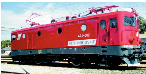
Fig. 2 The electric locomotive series 444