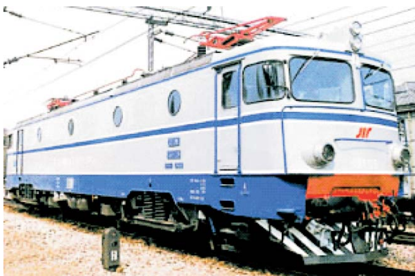
Fig. 3 The electric locomotive series 461

The fourth (four axles B'_0 B'_0 ) locomotive of the DC System 3 kV, series 342 was manufactured by Ansaldo Italy and has been operating in the region of Slovenian Railways since the year 1968 (Fig. 4). The next (six axles B'_0 B'_0 B'_0 ) DC system locomotive series 362 was also manufactured by Ansaldo Italy and has been already operating in Slovenia since the year 1960 (Fig. 5). The French locomotive (six axles C'C' ) series 363 has been operating in Slovenia since the year 1975 and is still representing the most frequent electric locomotive on the Slovenian railways today (Fig. 6). In