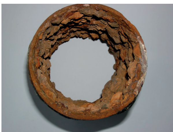
Figure 2 An example of moderately encrusted piping

The dimension design of internal water supply and individual water connections to buildings is always dependent on calculating the maximum and minimum water consumption connected to various branches of the water lines or water connections.