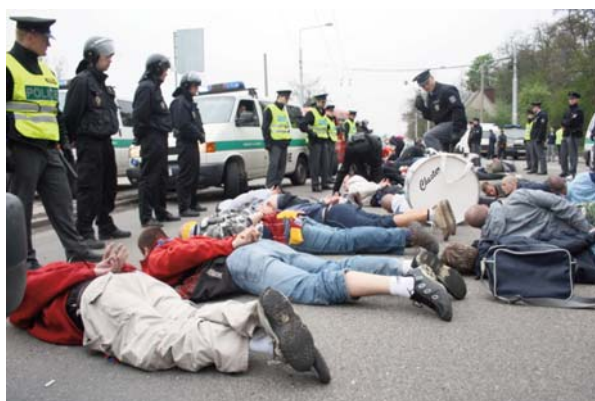
Fig. 1 The fans of the visiting team are handcuffed for having repeatedly refused the orders of the police [1]

Such procedure taken by the Police of the Moravian-Silesian region represented a clear message to football fans – the police are able to supervise and accompany fans securely to the so-called “hazardous matches”, so that common traffic and order in cities are not at risk (the police design routes through which, with the assistance from ACT members, the fans are directed). Understandably, the police also ensure security of the fans, so that fights among the fans of the two different teams are prevented. The police are ready to use forces and means needed to suppress any aggressive behaviour of the fans, who, when drunk, often irrationally seek to struggle with the police officers. From my personal experience,