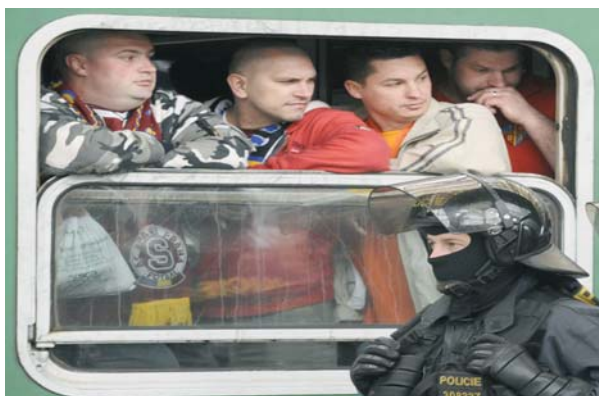
Fig. 2 Fans accompanied by police officers are leaving Ostrava against their will [2]

Safety measure is directed by a Commander, who controls the staff. Both the Commander and the staff are chosen by order of the Chief of Police or the Chief of Regional Headquarters. According to its purpose, safety measure is usually performed by members of IRS units or members of various services of the Police of the Czech Republic available in the location.