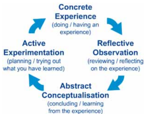
Fig. 1 Kolb's learning model [10]