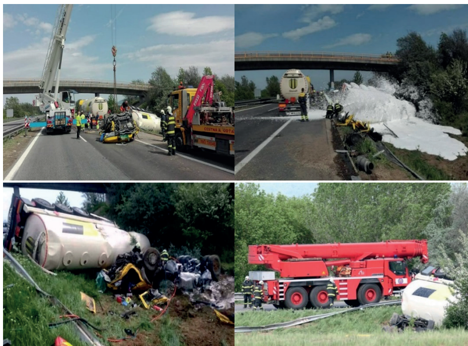
Figure 1 Tank accident on D1 [12]

[9]. Overview of numbers of incidents during the transport of dangerous goods by road in Slovakia in 2013-2015 is shown in Table 1.