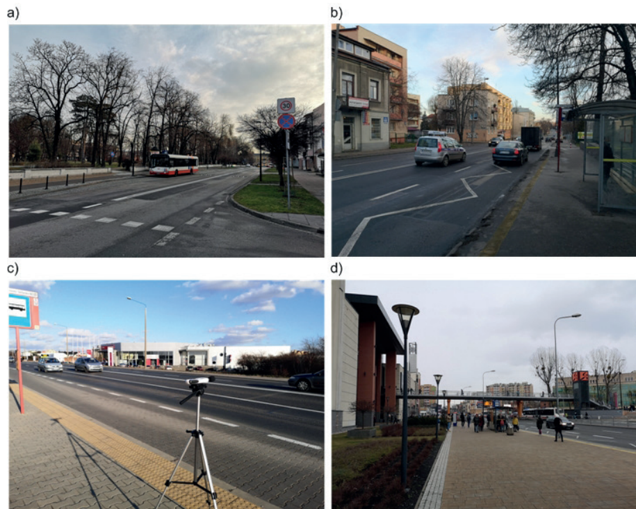
Figure 2 Location of the measuring zones: a) center zone "30", b) downtown c) access road to the center - city beltway, d) downtown - shopping mall

L_i - sound level over a period of time,